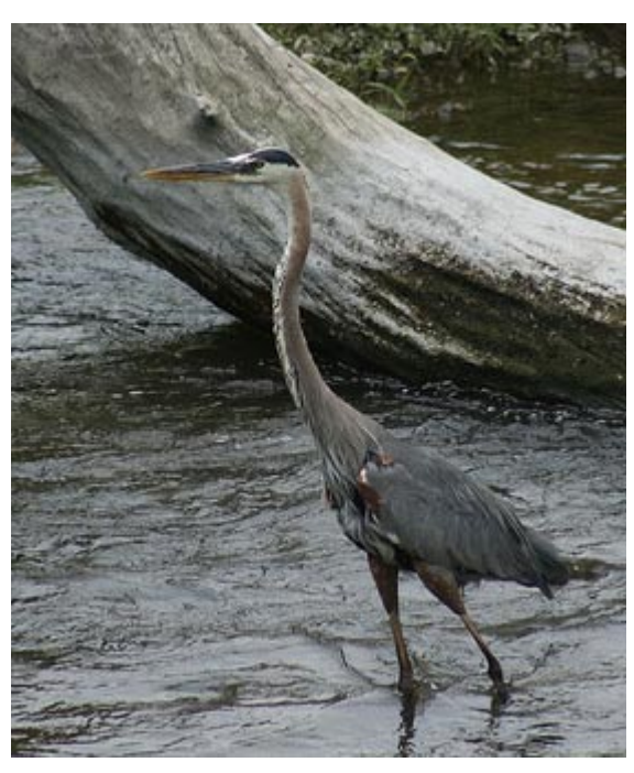
Blue Heron

We watched the first half of an outstanding documentary on wading birds by Judy Fieth and Michael Male titled Watching Waders .